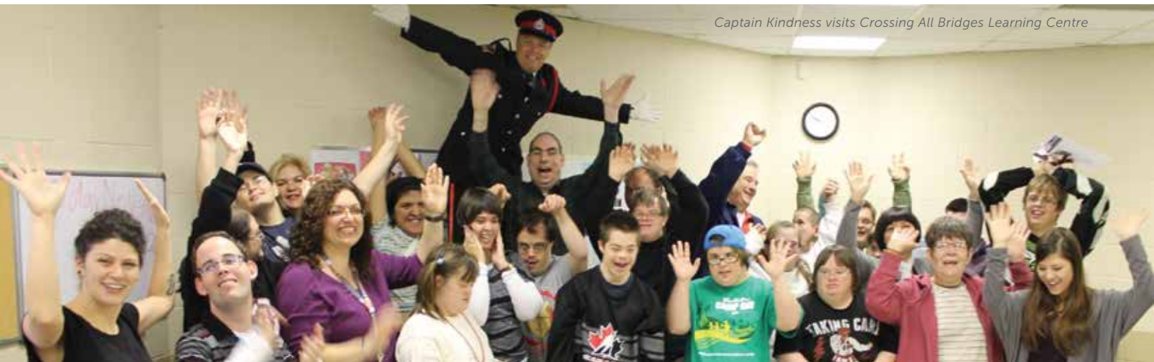
Captain Kindness visits Crossing All Bridges Learning Centre

Sharon Elaine Sienko Memorial Awards totaling $875 were given to 7 students who are "everyday heroes" in their school communities.